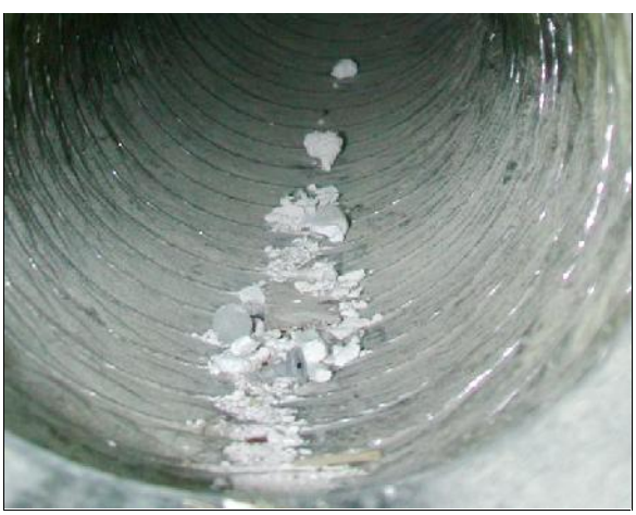
Construction debris in duct in newly built home May Indoor Air Investigations LLC

Don't assume that ducts will be clean in new construction. An HVAC system is used at one time or another during construction or renovation work, and the ducts become contaminated with construction debris, including drywall dust and biodegradable sawdust.