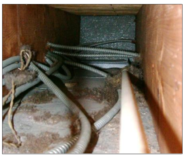
How can this panned bay ever be cleaned? May Indoor Air Investigations LLC

What about panned bays? I wish they had never been invented, frankly, because they are difficult (if not sometimes impossible) to clean, and they are open to allergenic dust within the framing.