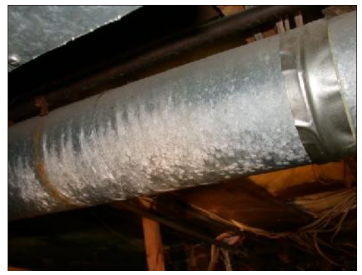
Condensation on metal duct May Indoor Air Investigations LLC

I hate to see fibrous lining material inside air handlers and ducts, because the material captures biodegradable dust. If you see condensation on metal ducts that have internal fibrous lining material, there's a good chance that there is mold growth within the ducts due to conditions of elevated relative humidity (metal is cold, the fibrous lining material in touch with metal is cooled, the material captures dust when filtration is inadequate, and mold takes root).