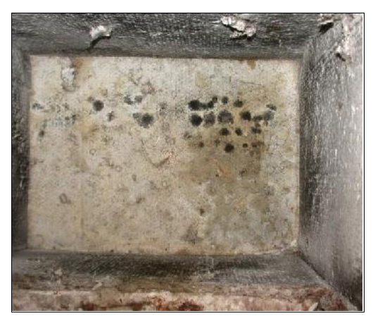
Visible mold growth in return plenum due to leaking humidifier

A leaking central humidifier can lead to mold growth within the return plenum.