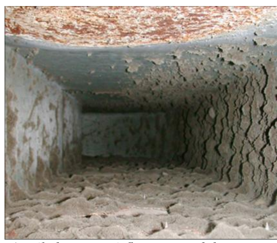
A soiled return; airflows created the pattern May Indoor Air Investigations LLC

On the interior, I'm always concerned about the condition of a duct system. In a house with hotair heat and/or central air conditioning, most of the air that occupants breathe is delivered through ducts. In a house with both hot-air heat and central air conditioning, people inhale the air from the ducts all year round.