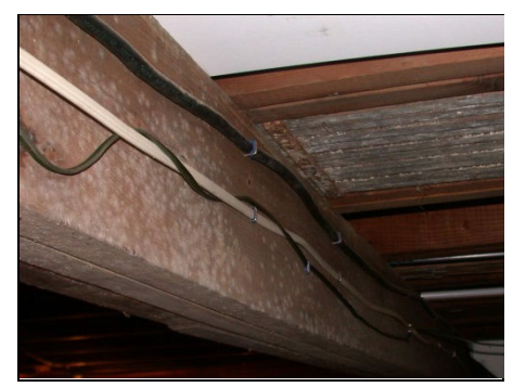
Aspergillus mold on joist and subfloor May Indoor Air Investigations LLC

Due to elevated relative humidity (RH), mold can grow on many surfaces, including on joists, subfloor, built-ins, stored goods, and the floor dust that you disturb while walking around. Sometimes this mold is visible to the naked eye, but usually not. If the basement smells musty, wear a mask. If a client has allergies, offer him or her a mask.