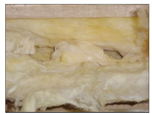
Mouse burrows in fiberglass

About 50% of exposed fiberglass insulation in unfinished basements is contaminated with mold growth, because the basements were not adequately dehumidified during one or more periods of time in the history of the buildings (even dead mold can be allergenic). If you see rodent "tunnels" in the insulation, the material also contains rodent liter. If you move such insulation, wear a mask. I know of one home inspector who wasn't wearing a mask when he moved contaminated fiberglass, and he experienced severe asthma symptoms.