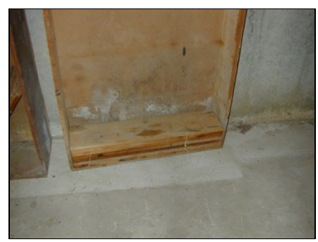
Mold on set of shelves; note efflorescence at bottom of foundation wall May Indoor Air Investigations LLC